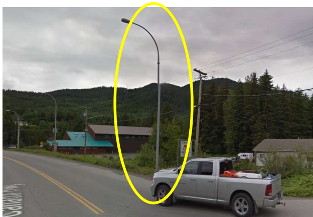
1 - Camera Pole (looking west)