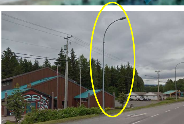
2 - Camera Pole (looking northeast)